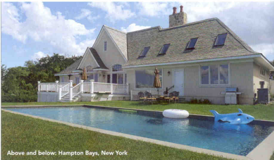
Above and below: Hampton Bays, New York

Outside are a garden and two dovecotes, which once sheltered the doves