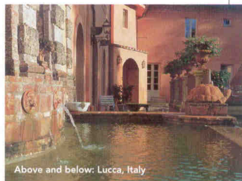
Above and below: Lucca, Italy

Lucca's distinguishing characteristic is the massively thick brick wall that surrounds this city in Tuscany. The wall was built in the 16th century to protect the city from invaders, and today it is traversed by a walking and biking path. Lucca is known for its medieval and Renaissance architecture, superb